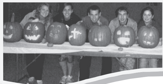
Newman students, carving pumpkins, making memories.